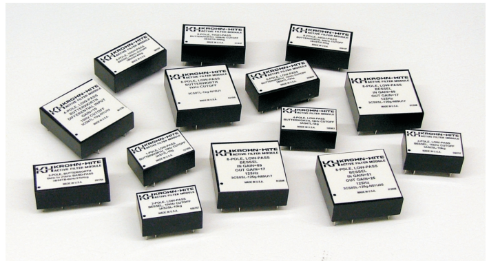
Filter Modules 3A, 3B, 3C and 3D